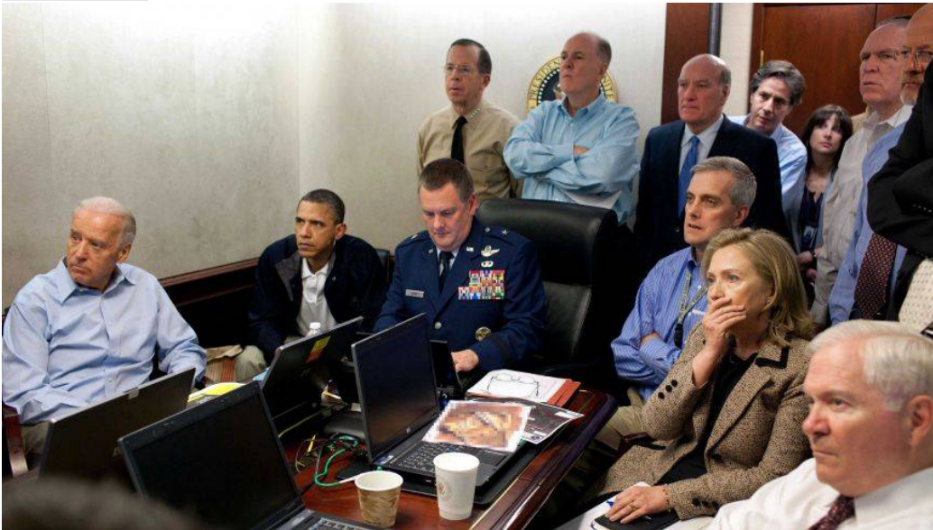
May 1: Secretary of State Hillary Rodham Clinton, President Barack Obama and Vice President Joe Biden, along with with members of the national security team, receive an update on the mission against Usama bin Laden in the Situation Room of the White House.